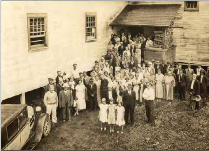
1936 Smalley Family Reunion at Grays River, Washington