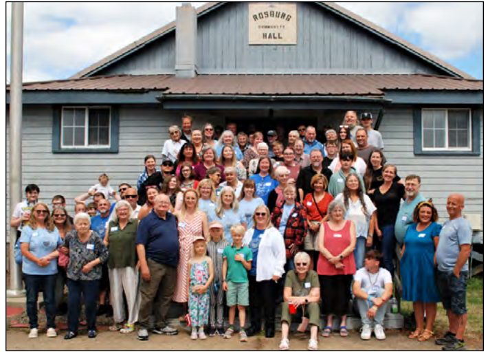
2023 Smalley Family Reunion at Rosburg, Washington