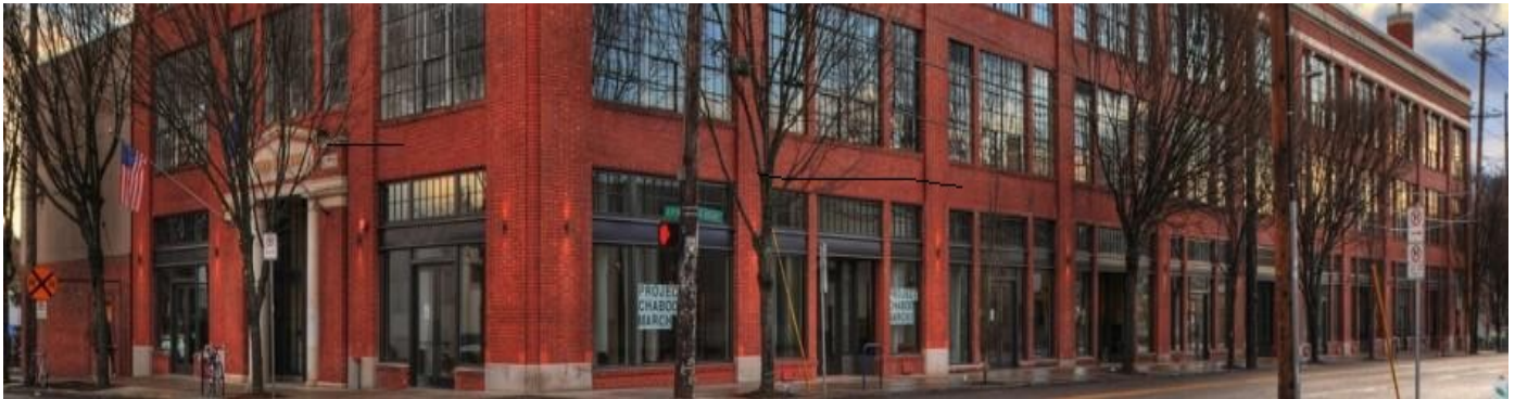
THE FORD BUILDING 2505 SE 11th Ave. Portland